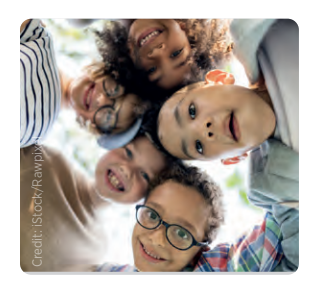
HOW INHERITANCE TAX WORKS

How establishing LPAs can make things simpler for your loved ones