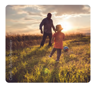
MAKING YOUR PLAN

Navigating the complex rules surrounding inheritance tax