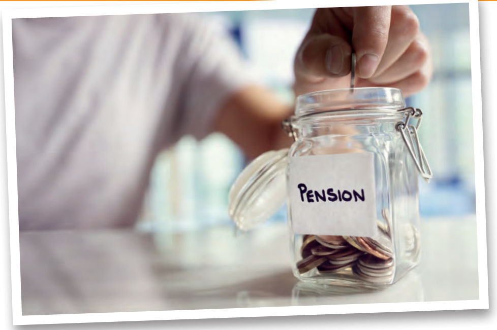
Tax and benefit laws can change. The Financial Conduct Authority does not regulate tax and benefit advice.

Your starting point is to check your NICs record at https://www.gov.uk/check-nationalinsurance-record, which will require you to have a Government Gateway user ID.